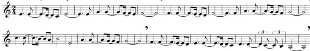
Little Train of the Caipira